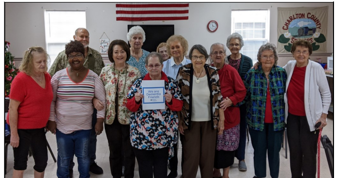
Dementia Friends Information Session held in Folkston at the Charlton Senior Center on February 6, 2020.

For more information on AAA services please contact SGRC-AAA at: 912-287-5888 or 1-888-732-4464 (1-888-73-AGING). Visit the AAA Website www.sgrc.us/aaa.html and like us at www.facebook.com/SouthernGeorgiaAreaAgencyonAging/ .